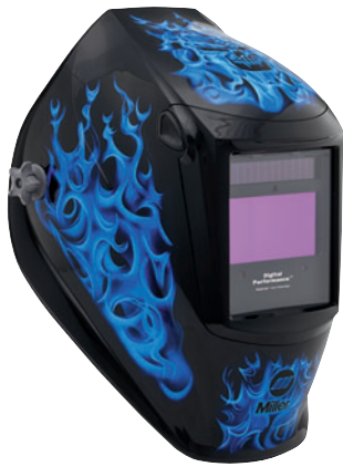
Blue Rage™ 282001