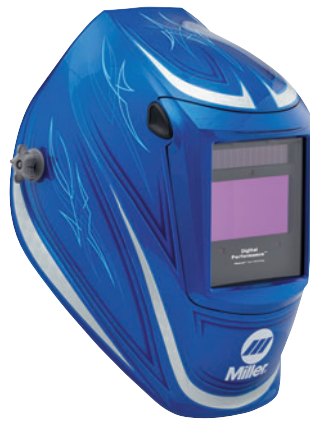
'64 Custom™ 282002